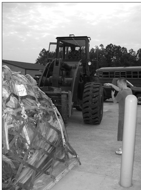
Right: Members of the 123rd Civil Engineering Squadron marshal pallets of equipment and cargo for deployment during Silver Flag 2006. The training event is required for all Guard, reserve and active-duty civil engineering units approximately once every three years. The Kentucky unit last completed Silver Flag training in 2003, just before being deployed to Iraq.