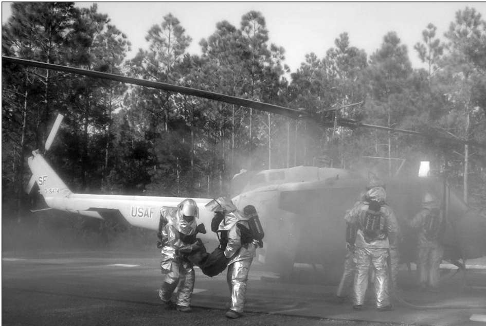
Above: Firefighters from the Kentucky Air Guard's 123rd Civil Engineering Squadron practice extracting wounded aircrew members from a smoking helicopter during Silver Flag 2006, held at Tyndall Air Force Base, Fla., from Oct. 14 to 21.

Airmen representing all four of civil engineering's primary missions — Air Base Operability (also known as disaster preparedness), Fire Protection, Explosive Ordinance Disposal and the Base Emergency